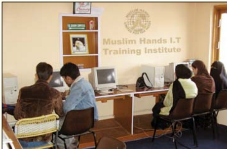
MH Computer Training Institute for Orphans, Srinagar

clampdowns and a collapsed economy. MH has been working in Kashmir (on both sides of the border) since 1994. From the setting-up of blood-banks in Kapwara, Baramullah and Rajory to the running of medical clinics along the LoC, numerous other development projects have been started in Kashmir over the past few years.