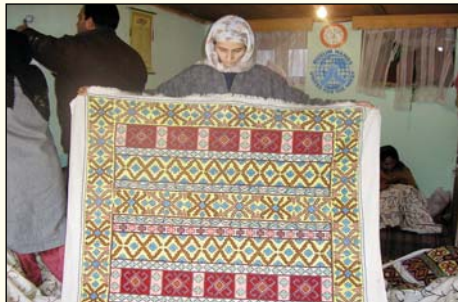
Handicraft Centres help support over 100 widows