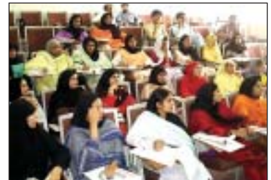
Teacher training, Islamabad

For a mere setup cost of £300 and a monthly running cost of £50 , you or your organisation can have your very own Rural Community School .