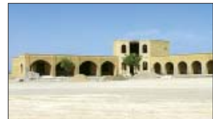
MH Bam Orphanage & School artists impression