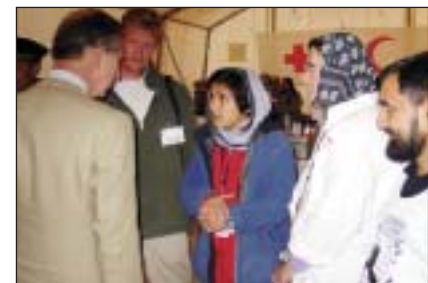
HRH Prince Charles with MH staff, Bam