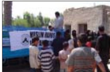
Najaf: Food aid arriving