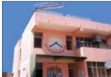
School of Excellence, Khartoum, Sudan