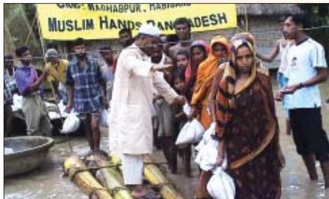
Bangladesh flood victims receive food aid, Sylhet

Persistent clampdowns, destruction of homes and livelihoods by the Israeli military have made life more difficult for Palestinians, now more than ever before. MH works in Al-Khalil, Jerusalem, Bethlehem and Gaza , providing long term aid through orphan sponsorship, construction of schools and planting of olive trees. Regular distributions of food and medicine continue to take place across the Palestinian territories. Last year alone we spent over £200,000 in Palestine.