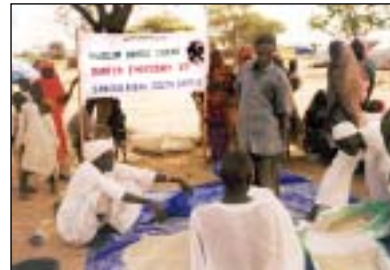
Emergency food distribution