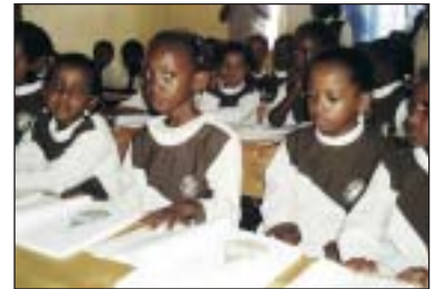
Typical Muslim Hands Model School