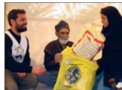
Jiroft: Distribution of clothing