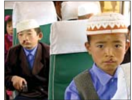
China: 70 children receive cleft-lip correction