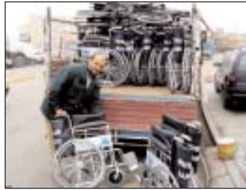
Baghdad: Wheelchair distribution

MH is supporting a unique centre for homeless teenage girls in Baghdad, to protect them from the dangers of the steets. This is a new, but growing problem for Iraq. This is the first centre of its kind in Baghdad, housing 25 girls, mostly orphans. MHIMP