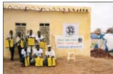
Sanitation Team with insecticide pumps