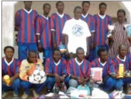
The Gambia: Sports equipment for Bunjeng School

MH has been providing sports equipment to poor school children in orphanages in Baghdad and The Gambia. Apart from the expected joy and pleasure gained by the children, our field workers too have found the project particularly satisfying!