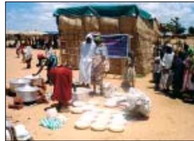
School Feeding Programme

The situation in Darfur is set to deteriorate further, irrespective of peace talks, as farmers have not been able to cultivate their lands before the rains, and a famine now looms.