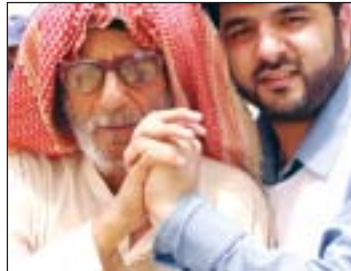
1-2-1 Elderly sponsorship