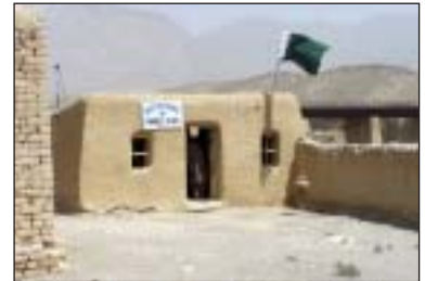
Typical Rural Community School