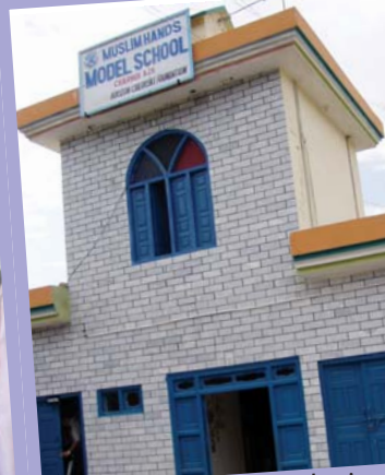
MH Model School, Kashmir