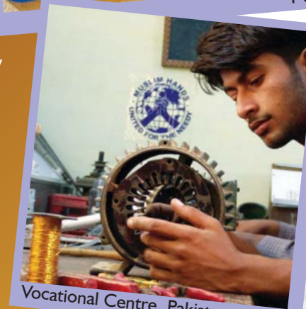
Vocational Centre, Pakistan

The 'School in a Box' project allows donors to set up their own Model Schools providing high quality certified education to the Oxford Syllabus Standard across a wide curriculum, and are managed by MH educationalists. The setup cost of £2000 includes Furniture, Computers, Teaching aids, and Text books.