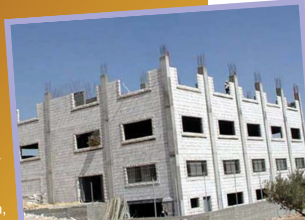
Building Beit Al-Maqdis School in Jerusalem

MH is currently helping construct the Beit Al-Maqdis School in Jerusalem, Palestine.