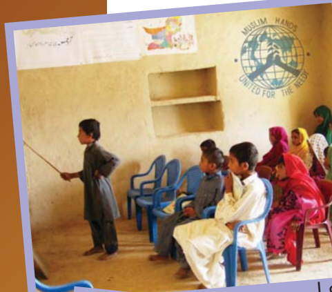
1 of 10 Rural community schools in Balochistan

10 rural Community Schools have already been established in Balochistan (Pakistan) - where illiteracy levels are some of the highest in the world. Providing very basic education (one teacher and around 30 children, one or two room schools) is a huge step forward for such rural areas. A further 100 such schools are planned for 2004.