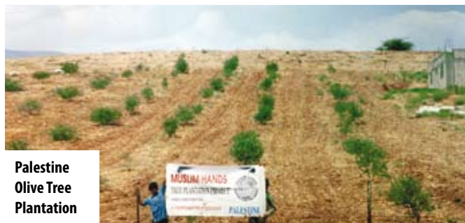
Palestine Olive Tree Plantation