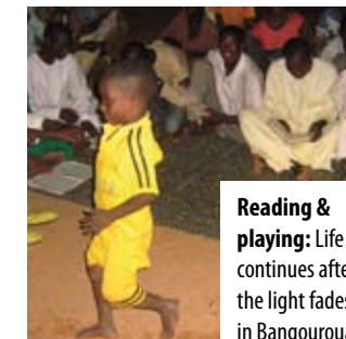
Reading & playing: Life continues after the light fades in Bangouroual