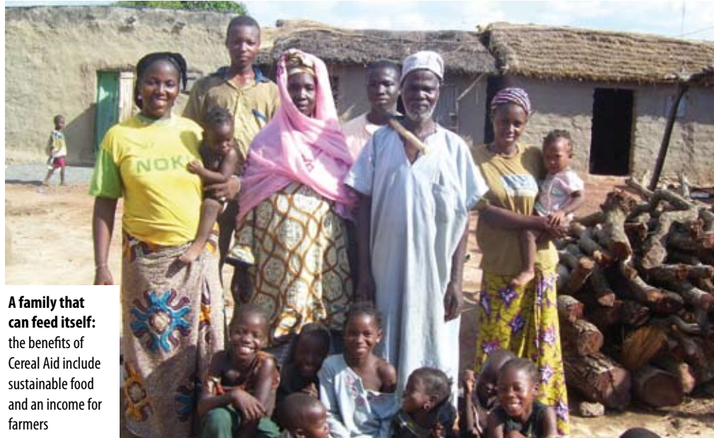
A family that can feed itself: the benefits of Cereal Aid include sustainable food and an income for farmers

Petty traders, students, teachers and community workers are amongst those that have benefitted from the project.