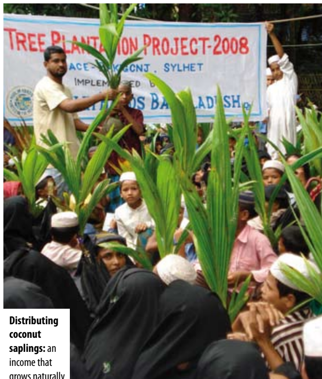
Distributing coconut saplings: an income that grows naturally

Students were given saplings to plant in their neighbourhood and help raise awareness of environmental issues.